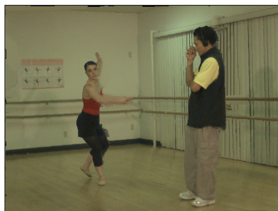
(g) V_{5 \rightarrow 4} inpainted with our method