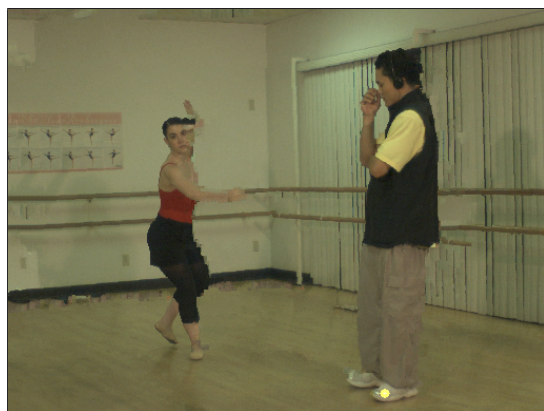
(e) V_{5 \rightarrow 4} inpainted with Daribo's method