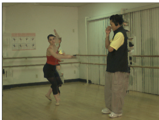
(c) V_{5 \rightarrow 4} inpainted with Criminisi's method