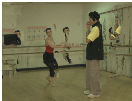
(d) V_{5 \rightarrow 2} inpainted with Criminisi's method