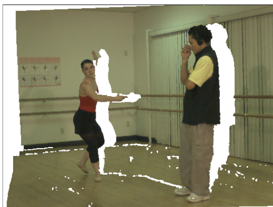
(a) V_{5 \rightarrow 4} after warping and background antighosting