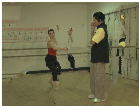
(f) V_{5 \rightarrow 2} inpainted with Daribo's method