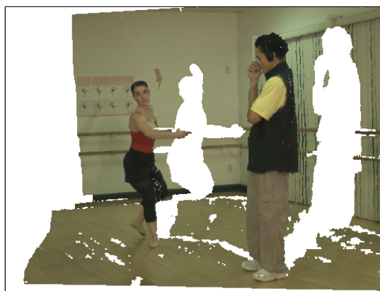
(b) V_{5 \rightarrow 2} after warping and background antighosting