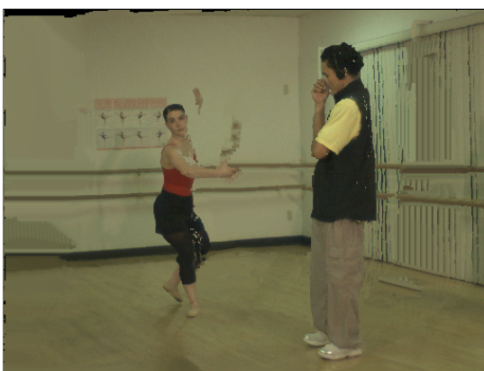
(h) V_{5 \rightarrow 2} inpainted with our method