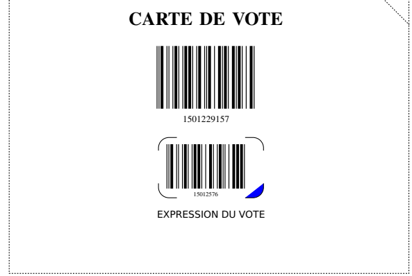
Figure 3. A cast ballot. The 8-digit barcode for the chosen candidate list (here list #3) is affixed just above the mention “ Expression du vote ”.

Alternatively, one might also look at the last 4 digits of the list IDs individually and remark that each of them forms an increasing sequence, except for the third one which is decreasing. In other words, noting xyzt the last 4 digits of