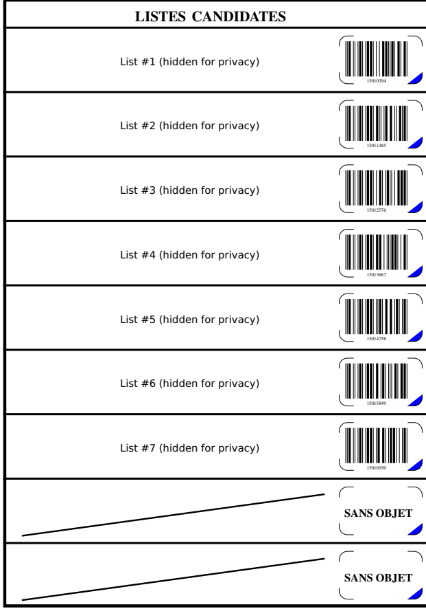
Figure 2. The sheet with the names of the lists running for the election (hidden here for privacy). A sticker with an 8-digit barcode is associated with each list.

2) List identifiers : Let us now consider the last 4 digits of the list identifiers: 0394, 1485, 2576, 3667, 4758, 5849, and 6930. The somewhat regular increasing of these 4-digit sequences, when seen as decimal integers, hints at a kind of arithmetic progression. Indeed, there appears to be a common difference of 1091 between the first 6 numbers. However, trying to extend this guess to the last one, one remarks that 5849 + 1091 is 6940 and not the observed 6930: it seems that the first carry digit was not propagated to the second digit. This led us to believe that the last digit had to be considered separately, as would be the case for a check digit, for instance.