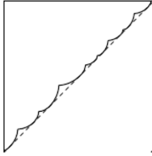
FIGURE 3. The map T .

If x \in W then T(x) \in W . Indeed, if T(x) \notin W , T(x) is a fixed point so T is constant on [x, T(x)] ( T is non-decreasing). Let q be any rational number in (x, T(x)) : T(x) = T(q) is then computable, but does not belong to W : impossible. \square