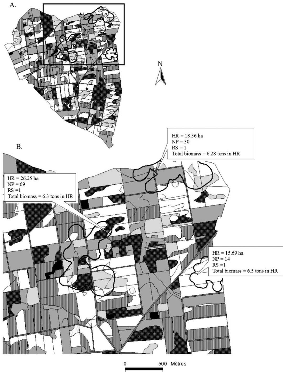
Figure 2. (A) Distribution of forest plots, roads, trails and vegetation associations within the forest of Trois-Fontaines. (1360 ha in eastern France, map year 2002). (B) An illustration of three contrasted home ranges size (HR) (in terms of number of patches: NP) of roe deer females and three different tactics of habitat use according to spatial variations in habitat quality so that females get similar food resources in highly productive environments. Home range size has been standardized for year and reproductive status (RS). An example of home range is presented in the east of map (trait thick). Different gray scale shadings illustrate heterogeneity in forest types (McLoughlin et al. 2007) with richest habitat in white and poorest habitat in black.

energetic limitations reflecting the metabolic needs. The number of patches a home range contains and the female identity accounted for most observed variation in home range size of roe deer females at Trois Fontaines. On the other hand, female body mass, population density and