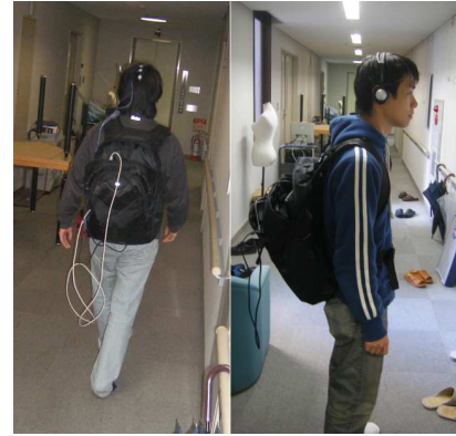
Figure 1: Subjects performing the experiment: Left: walking condition, Right: standing condition.

During the experiment, subjects could hear two brief sounds (the auditory stimuli), in the headphones, appearing in a random order. A sound was generated every 1s. One of the two auditory stimuli, the so-called target stimulus, was