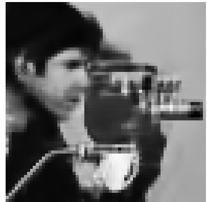
BM3D-SAPCA (28.16, 0.8269)