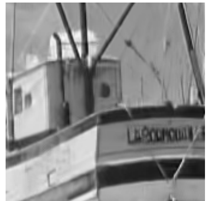
BM3D (29.90, 0.8010)