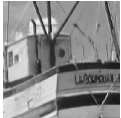
BM3D-SAPCA (30.02, 0.8037)