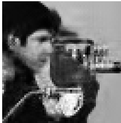
P.SADCT (27.51, 0.8143)