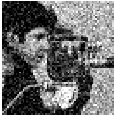
Noisy, \sigma = 35