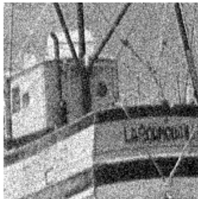
Noisy, \sigma = 25