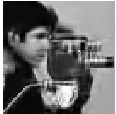
BM3D (27.82, 0.8207)