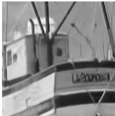
SA-BM3D (29.83, 0.7994)