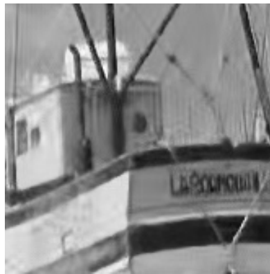
P.SADCT (29.47, 0.7882)