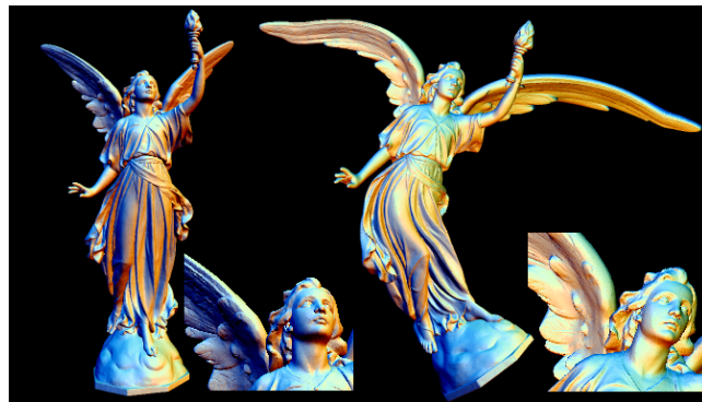
Figure 2: The interactive smooth deformation of this model (28M triangles) has been done in less than 5 minutes, including pre and post streaming process, with our system.