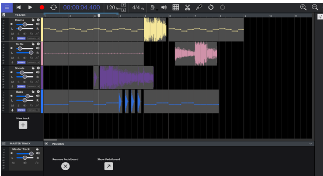
Figure 1: Tracks in WAM Studio. Regions can be audio or MIDI and can overlap, be moved, deleted, split, merged, etc.

WAM Studio is an online Digital Audio Workstation (DAW) for creating audio projects, designed as multi-track musical compositions [3]. It has been designed around the standard for Web Audio plugins and hosts called "Web Audio Modules" (or "WAM") [2]. Each track represents a different layer of content that can be recorded, edited, played back or integrated with audio files. Some tracks can control virtual instruments, containing only the notes to be played and metadata. Users can add or delete tracks, play them individually or together, and arm them for recording (Figure 1).