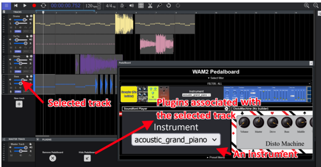
Figure 4: WAM plugins associated with a track.

Any configuration can be saved as a named preset (e.g. "crunch guitar sound 1", "Synthesizer with ambient audio effects"). Presets can be organized into sound banks ("rock", "funk", "blues"). Managing the organization and naming of banks and presets is the responsibility of the WAM-bank plugin. The parameters exposed by this plugin correspond to all the parameters of the active preset (i.e. the sum of the parameters of the preset's plugins in the chain) and can be automated by the DAW.