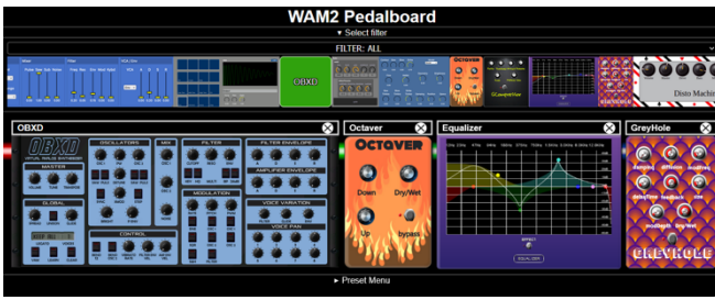
Figure 3: The WAM-bank plugin that manages chains of plugins (virtual instruments and audio effects) associated with each track.

Any configuration can be saved as a named preset (e.g. "crunch guitar sound 1", "Synthesizer with ambient audio effects"). Presets can be organized into sound banks ("rock", "funk", "blues"). Managing the organization and naming of banks and presets is the responsibility of the WAM-bank plugin. The parameters exposed by this plugin correspond to all the parameters of the active preset (i.e. the sum of the parameters of the preset's plugins in the chain) and can be automated by the DAW.