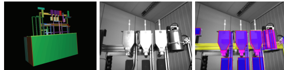
(a) The 3D model (b) The keyframe (c) The overlay

bertian surfaces (and therefore highly sensitive to the lightening conditions). It shows the benefit of the selected approaches and the intrinsic robustness of the algorithms to the illumination changes.