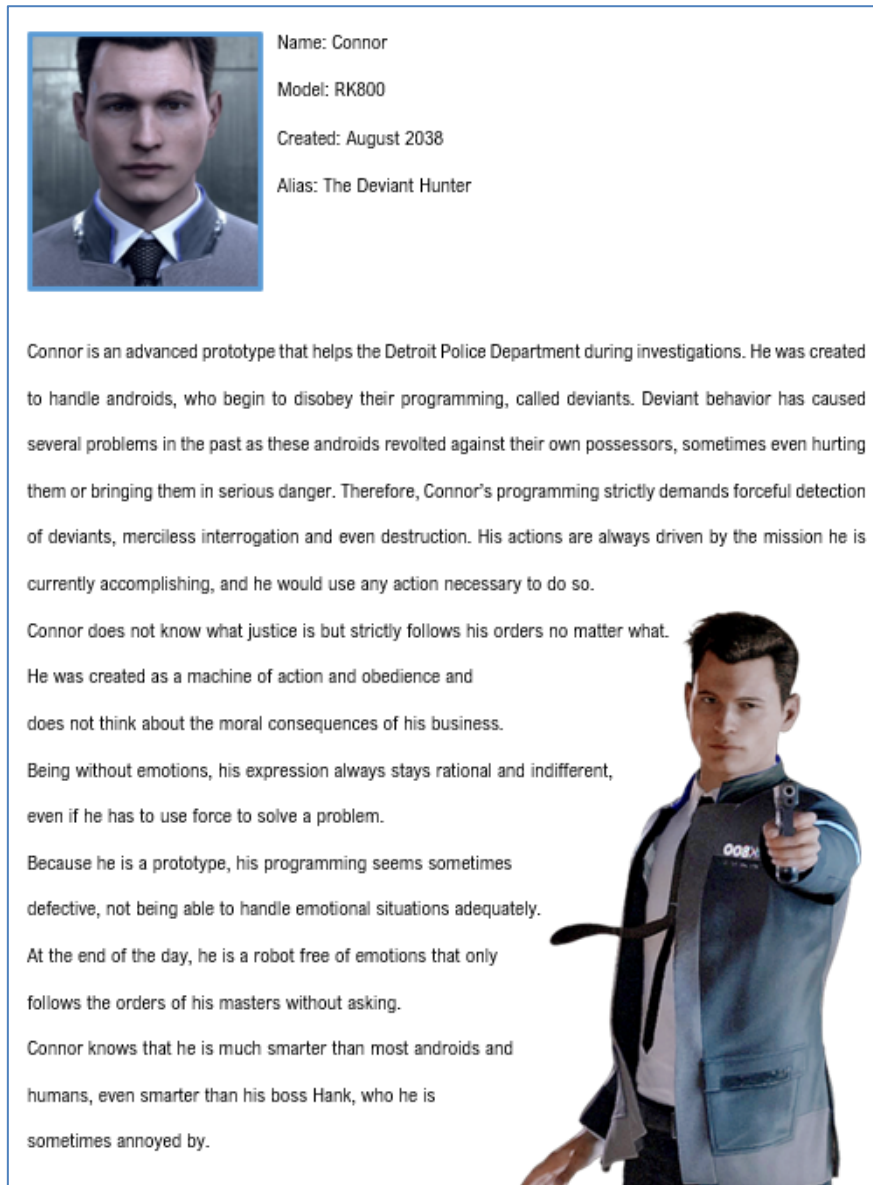
Fig. 2. Exemplary character sheet to frame Connor morally disengaged.

To frame Connor's character as either morally engaged or disengaged we used different character sheets presented to participants before playing. In the engaged condition Connor was described as warm and empathic, whereas in the disengaged condition he was introduced as rational and merciless (see Fig. 2). Participants in the control