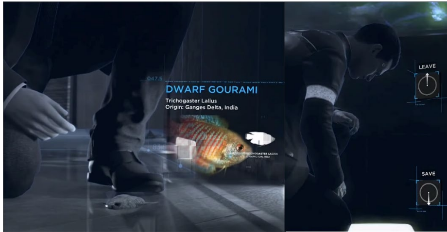
Fig. 1. Screenshot of an exemplary moral decision in the chapter The Hostage . Returning the fish to the aquarium (i.e., save) is coded as the moral option. Note: Modified screenshot from Detroit: Become Human , © 2018 by Sony Interactive Entertainment.