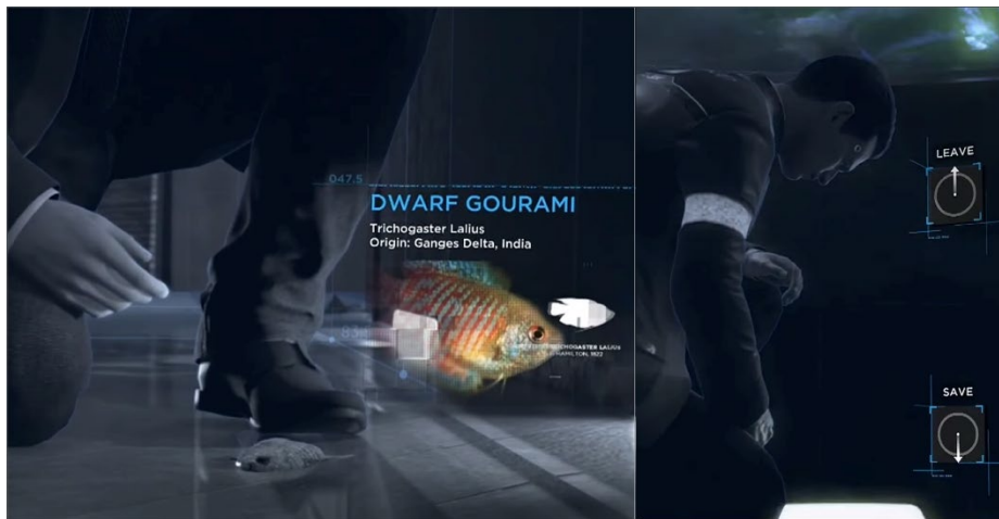
Fig. 1. Screenshot of an exemplary moral decision in the chapter The Hostage . Returning the fish to the aquarium (i.e., save) is coded as the moral option. Note: Modified screenshot from Detroit: Become Human , © 2018 by Sony Interactive Entertainment.