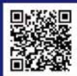
Cyber Security Job File vol.1