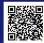
The Compass for Information Literacy Enlightenment