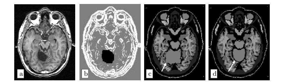
Fig. 2. Segmentation of a patient image containing a resection. (a) Patient image. (b) Confidence (resection is in black). (c) Result produced by a simple registration, un-aware of the resection. (d) Result produced by our algorithm, exhibiting a better segmentation of the cerebellum (see white arrows).