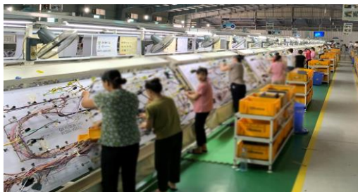
Fig. 2. Photo of an assembly line

We consider two positional constraints required from the company. The first one is a task positional constraint which restricts the assignment of tasks located far from each other to a worker. The other one is a worker positional constraint where the working