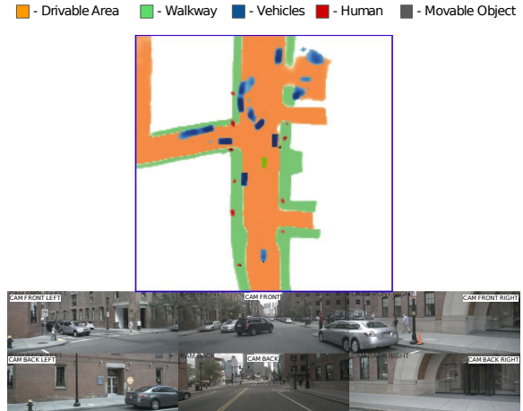
Fig. 1: Semantic grid predictions by LAPNet for classes in the NuScenes dataset [7]. By using LIDAR information to aid the projection of camera features, our method allows the creation of more precise semantic grids compared to camera-only methods. Best viewed with digital zoom.

1 Authors are with the Chroma team, INRIA Grenoble Rhone-Alpes, France. 2 Authors are with CITI-Lab, INSA Lyon, France. 3 Author is with Hacettepe University, Ankara, Turkey. Correspondence: manuel.diaz-zapata@inria.fr