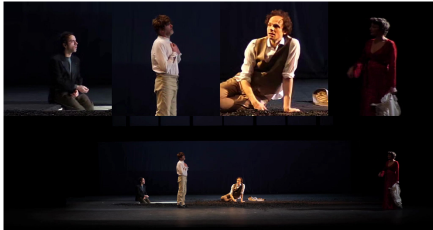
Fig. 1. KinoAI workflow. Bottom: The stage is filmed with a fixed camera in ultra-high definition. Top: We generate candidate shots with different compositions on the server side and allow remote users to edit them into movies on the client side.