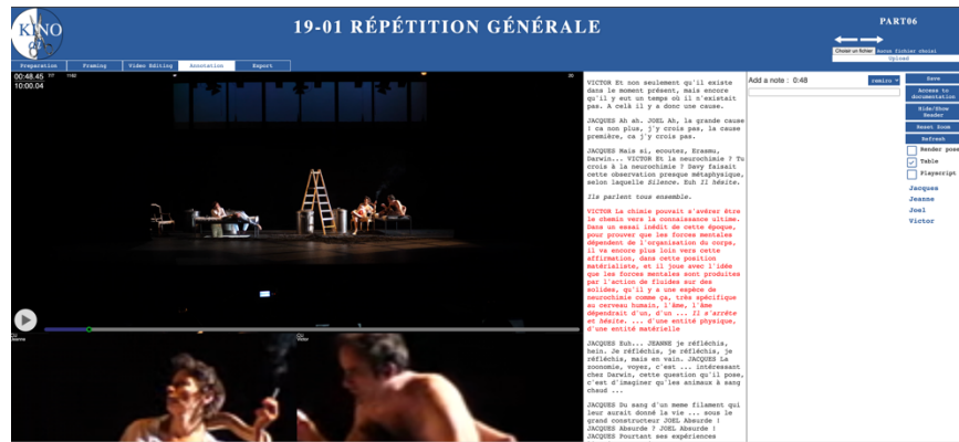
Fig. 5. Annotation view. OpenKinoAI provides tools for annotating rushes and movie scenes.