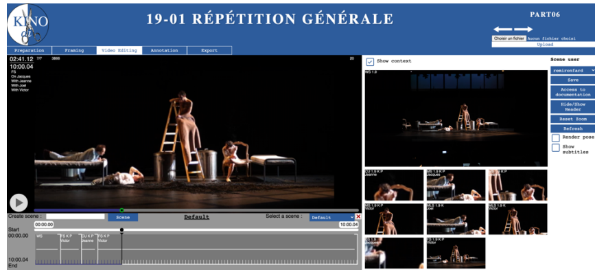
Fig. 4. Video editing view. OpenKinoAI provides tools for online video editing using all available rushes into movie scenes.