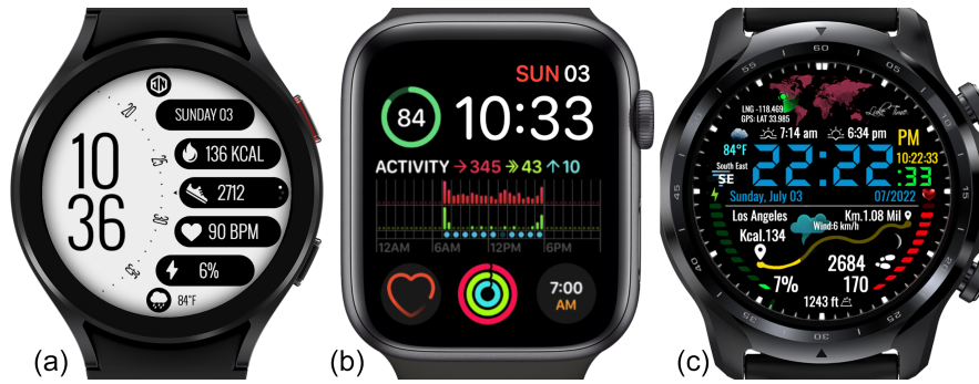
Figure 2: Example of sports smartwatch faces. Watch face design by: a) JN-Rolling (JN-WatchFaces), b) New Design (Enid Rodriguez), and c) Voyager GPS-01RB Sport 24H (Luke Time) from Facer App [45].