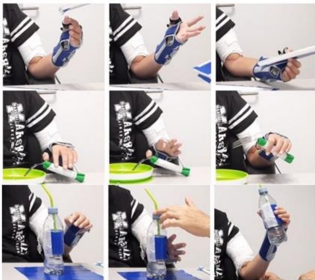
Figure 2: Example of 3 tasks achieved by participant 1. Top: key grip pinch. Middle and Bottom: palmar grasp.

Tests confirmed the ability to produce multiple movements including functional and reproducible key-grip and digito-palmar grasping. In participant 1, voluntary muscle contraction detection and voluntary movement detection control interface modalities were successful. For participant 2, only the voluntary movement detection modality was possible due to an important fatigability of the shoulder muscles. The success rate in task execution was estimated using Motor Capacity Scale C score at 54% for patient 1 and 51% for patient 2. The results will be detailed during the presentation at the conference.