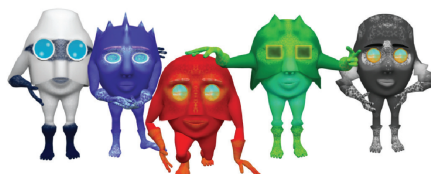
Fig. 1. Left to right -hydrogen, nitrogen, oxygen, chlorine and carbon

Story The concept of content-infused story games (CIS Games) builds on the fusion between games and stories to educate children [17]. Building upon this concept, a facet of the tangible cube is designed to identify with the element it represents holding a book. These animations feature in short, funny animation clips, turning into stories the outcome of joining two or more elements, and the reactions that this might trigger. For example, one of the stories dedicated to hydrogen presents the characters having fun in a water-park. Two hydrogens slide down a water toboggan and get stuck at the end of the ride. The oxygen