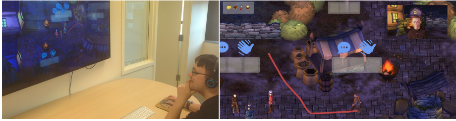
Fig. 2. (Left) An orchestrator manage NPCs and items, and uses a headset to voice the NPCs. (Right) The NPC in the centre moves along the path traced out by the orchestrator in red. The blue buttons allow the orchestrator to trigger speaking and waving animations. The window inset in the top-right shows the players' view.

of a fugitive named “Helena”. They must interact with residents of the town – the voiced NPCs – to find and bring Helena to justice. As the players explore and interact with the townsfolk, they collaboratively build a story with the orchestrator. Northaven is a mediaeval townscape consisting of homes, farms, a church, an inn and a market square. Six NPCs inhabit the town.