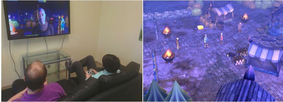
Fig. 1. (Left) Players of Persiflage are collocated, sharing a couch and TV. In conversation, the orchestrator’s voice is played through the television set. (Right) The players’ characters are dressed in blue and red in their shared view of Northhaven.