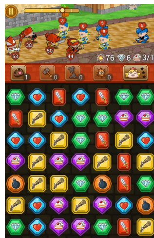
(b) Fat Princess - Piece of Cake