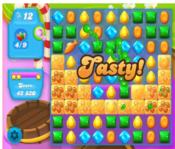
(a) Candy Crush

Quimi-Crush is similar to famous match-3 puzzle games, like “Fat Princess - Piece of Cake” [6] and “Candy Crush - Soda Saga” [3] (Fig. 1). One of the main objectives in “Candy Crush - Soda Saga” is making a certain quantity of combinations containing objects that look like soda bottles. In order to reach that aim it is necessary to keep combining “candies” to create opportunities to release the “soda bottles” objects. In “Fat Princess-Piece of Cake”, the player must defend himself from waves of enemies that increase according the progress of the player in the game. The player team has characters that perform attack and defense actions from the combination of pieces on the board.