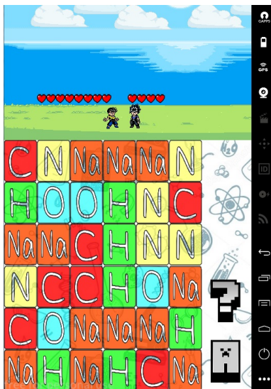
Fig. 2. Game play screen where chemical combinations occur.

the combination of components produces an oxide, the hero will attack and the villain will lose a heart.