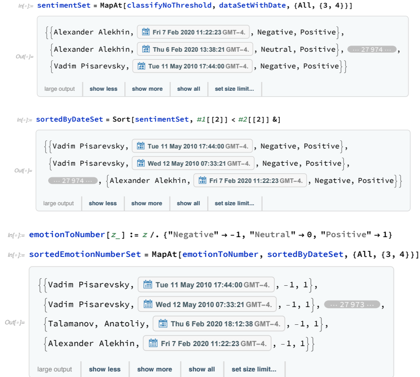
Fig. 3. Sentiment analysis, sorting, and affect sequence creation.

The resulting sequence can be integrated and plotted. In Fig. 4, we show the first 500 data points in the affect sequence and highlight a few instances of emotional contagion found in it. The X axis is time, and the Y axis is the emotional accumulation level.