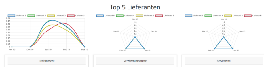
Fig. 4. Screen for operative sourcing decision “Which supplier is ordered from?”

The operative decision from which supplier a material should be ordered serves as an example of the visualization (see Fig. 4 ). This decision is strongly influenced by supplier evaluations. For the five best-rated possible suppliers their service level, the response time and the delay rate are visualized. Moreover, the average price and the average procurement time for these suppliers are compared.