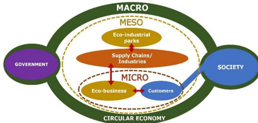
Fig. 3. Connection between agents in the symbiotics of the Circular Economy and the performance of the macro, meso and micro levels. Source: the authors.

Figure 03 demonstrates how the macro-level involves the whole society, the meso-level involves the entire supply chain and its evolution in EIP's, and the micro-level involves the relationship between company and customers.