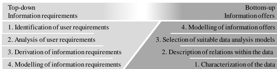
Fig. 2. Top-down-bottom-up approach for designing DS

To extend the existing research on DS a top-down-bottom-up approach to design DS in PPC was developed. The aim is to fulfill the information requirements of production planner and controller by providing the necessary information. As a result the PPC should improve through better decision support and reduced information search efforts. Therefore the information needed (information requirements) of the users are identified top-down. Additionally, the data base is described bottom-up to describe the information provided (information offers). In the following, this approach is presented in detail, Fig. 2 gives an overview of the approach.