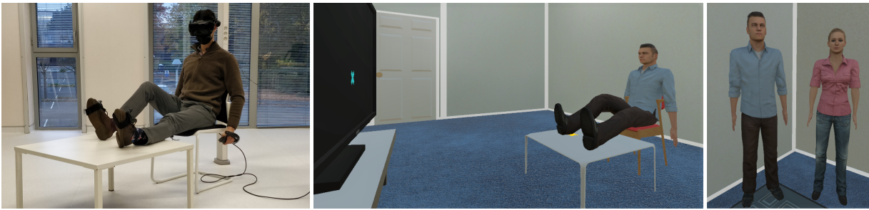
Figure 1: Experimental setup, with headset, controllers and trackers fitted on a participant (left), the virtual environment with the male avatar (middle), and the two avatars (right).