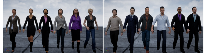
Figure 1: Female and male walking characters used in our study. Characters from left to right: F1, F2, F3, F4 and F5 (left image) and M1, M2, M3, M4, M5, M6 (right image).