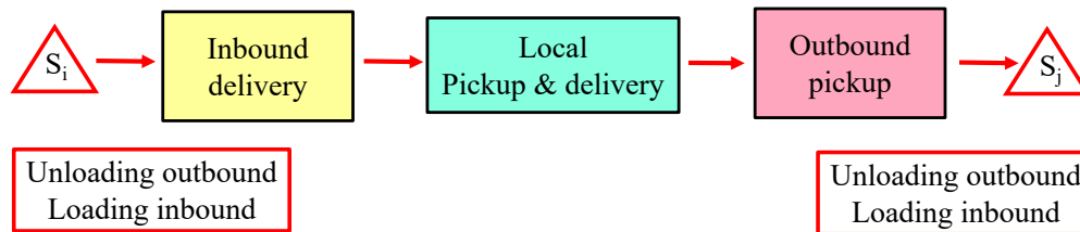
Figure 3: Pseudo-Backhaul Pickup & delivery city-freighter route

More complex strategies, still abiding by the LIFO rule, may be defined, as described in Crainic et al. (2012). The authors also emphasize that the efficiency of the routing problem, in terms of the number of vehicles, total cost, and time, will increase with the degree of integration of operations. Yet, on the other hand, the managerial and operational (particularly for the driver performing the loading and unloading operations) complexity would increase as well. The authors thus generalize the VRP-with-Backhauls idea and propose a Pseudo-Backhaul strategy, where several delivery, pick-up, and P&D sequences may be combined, provided each sequence is completely finished before a different type of operations is undertaken (the partition of the second inbound-delivery sequence in Figure 2 contradicts this definition). Figure 3 illustrates a city-freighter route implementing a Pseudo-Backhaul policy while servicing inbound, outbound, and local demand customers between two satellite visits.