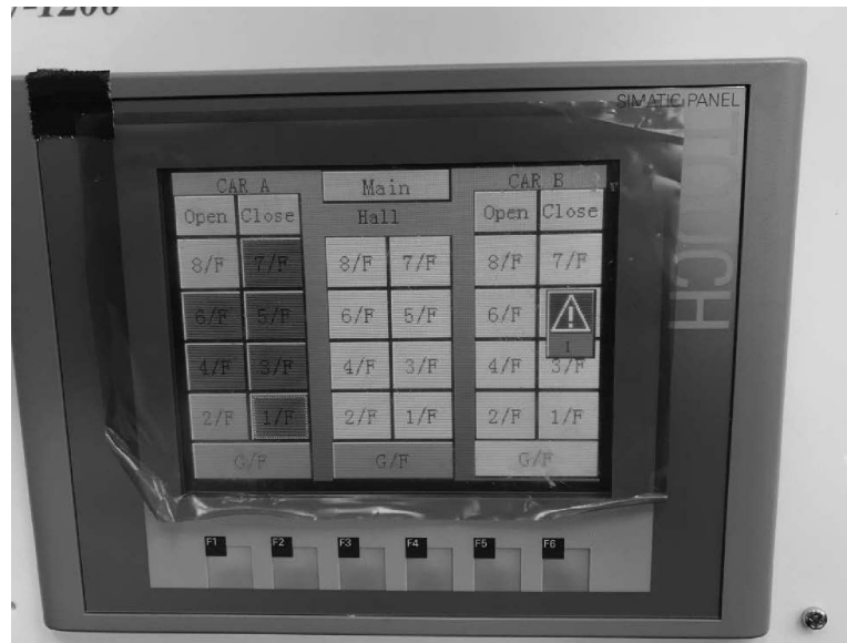
Figure 1. Human-machine interface screen after a denial-of-service attack.