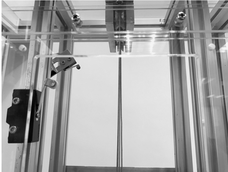
Figure 3. Elevator touch sensor.