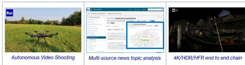
Fig. 3. AI4Media aims to empower the whole news production process: from news analysis to high-quality and impactful content creation.

Results of AI4Media are expected to bring benefit along the whole value chain, including journalists, editorial staff, TV production, rights and privacy management departments, as well as media researchers. Finally, to the audience, who will enjoy always new, modern, original and high-quality content.