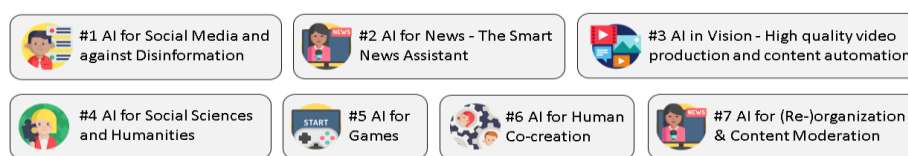
Fig. 1. The AI4Media use cases.

The use cases deal with a broad range of media processes that will be optimized and enhanced by the application of state-of-the-art AI technologies. The industry partners gather a set of user requirements for new AI functionalities with a view to upgrade available tools already used by the media sector with AI features developed by the project (see section 2). In the following, we present the seven use cases.