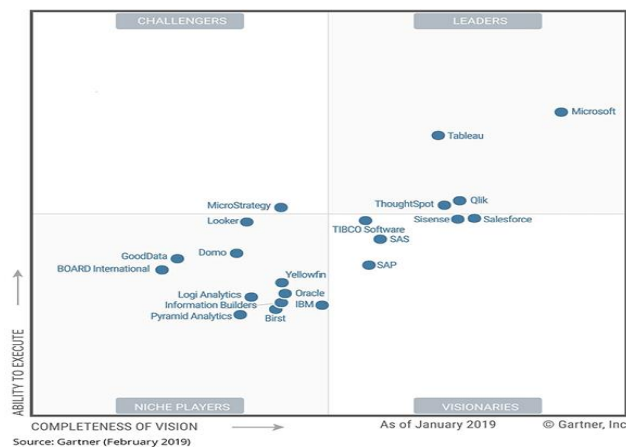
Fig. 1. Gartner Magic Quadrant for Analytics and Business Intelligence Platforms (Orad, 2019)

There are a number of currently available commercial Business Intelligence tools that include the ability to create visualisations, which can be utilized by professionals in a number of different fields and industries. Figure 1 below shows the Magic Quadrant for Analytics and Business Intelligence Platforms published by Gartner in February 2019. This quadrant displays the ‘leaders’, ‘visionaries’, ‘challengers’, and ‘niche players’ of business intelligence platforms and provides a good overview of the landscape of the industry at present.