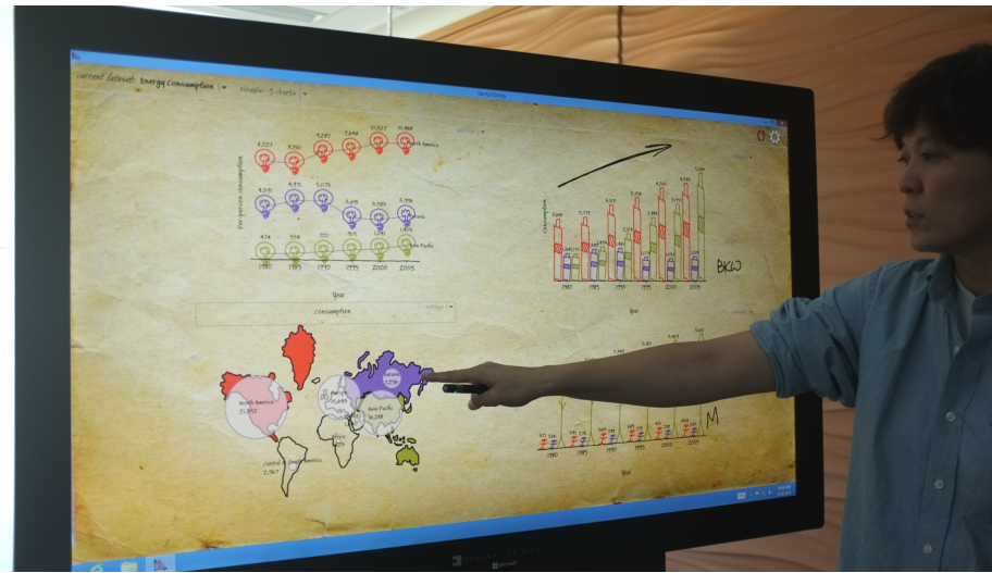
Fig. 1: SketchStory attracts attention and creates anticipation using a real-time approach to content creation with pen and touch interaction.