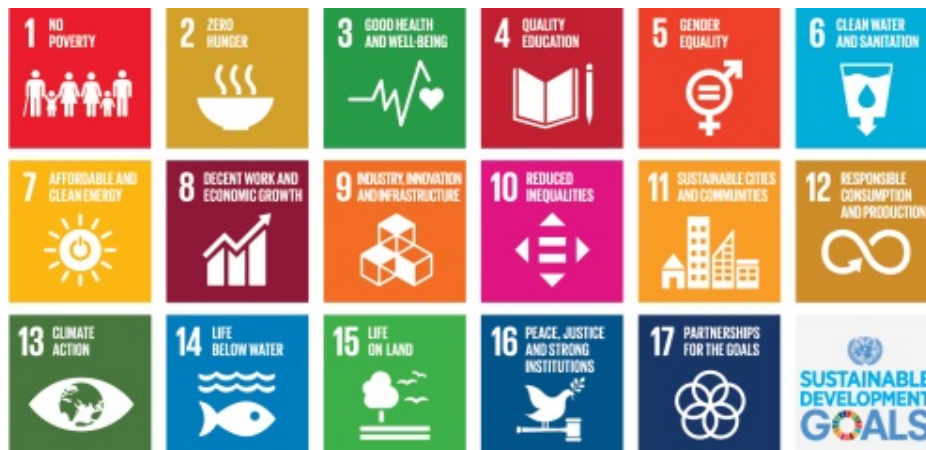
Fig. 4. Sustainable Development Goals

Today we have to face important challenges, such as those of UN for sustainability. AI can directly improve goal 6, 7, 9, 11 and next from Fig. 4. It may also influence improvement of others.