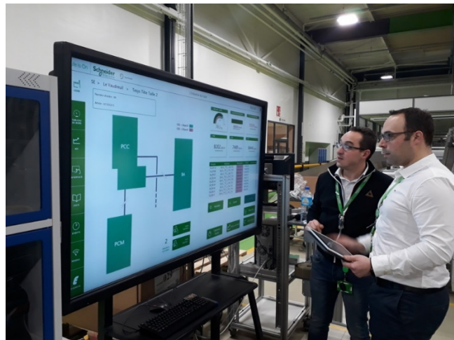
Fig. 3. Schneider Factory of the Future, Vaudreuil, source Schneider Electric [28]

Industry 4.0 implemented the principle of collaboration human-machine in co-bots [26] and some factories of the future, such as those of Schneider Electric in Vaudreuil. AI powers the cyber physical systems and digital twins [27].