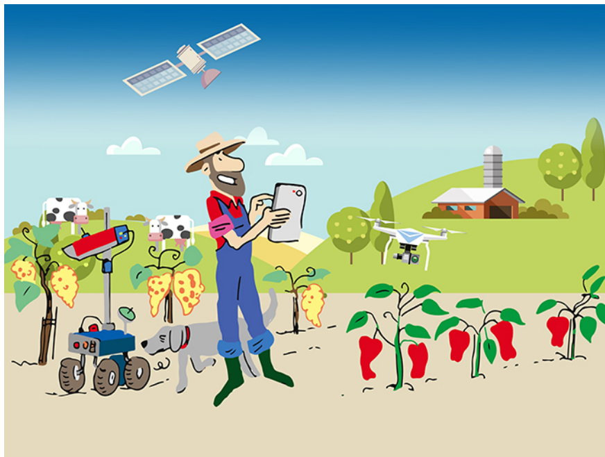
Fig. 5. Connected Farmer, source [35]

We can imagine another approach combining the knowledge about soil and environment with knowledge about crop rotation, association of vegetable/fruits to avoid pests attack, chose the right period for sow and plant in function of available seeds. Such farmer advisor programmed applying green software principle can be powered with solar energy.