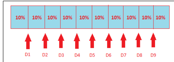
Fig. 1. Decile Scale Calculation

D(n) = \text{PERCENTILE}(\text{data\_values}[ ], n/10) , where n = [1,9] , data values = array of values.