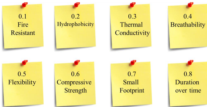
Fig. 3. List of the requirements of this study

Step 2. Any requirement is analyzed in detail by defining a specific pool of reference documents. In order to create the best pool of documents, a semantic based strategy is introduced. For instance, if we look for information related to the " fire proof " requisite, we can use many different patterns dealing with: