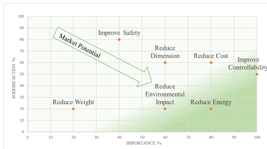
Fig. 1. Example of market potential graphical analysis

Among the various approaches used to evaluate the market potential, a technique consists in the evaluation of a series of customer needs and requirements. These approaches are able to define customer needs or requirements, with a structured procedure to translate them into technical parameters and plans to produce products that essentially meet those needs. Benchmarking is one of the first form of structured product development. Products are compared with industry bests from other companies and improvements are planned to cover possible gaps or to overcome competitor's performances. In particular, satisfaction is a measure of how products and services supplied by a company meet or surpass customer expectation. In a scale from 0% to 100%, 0% is the absence of the feature or great dissatisfaction, 100% is maximum satisfaction. The aforementioned definitions are given to experts before the interviews for the evaluation.