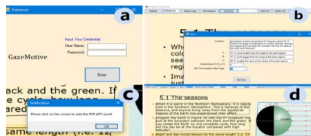
Fig. 1. Screenshots of expert interface showing an example of (a) login, (b) adding a quiz, (c) the process of adding an AOI, and (d) the AOIs added.

GazeMotive was designed for two user groups, expert and learner. When a user logs on with a username and a password (see Fig. 1.a), the system will redirect the user to either the expert interface or the learner interface. The expert interface allows an expert user to add or delete learning materials, page by page. The expert user can then input self-assessment quizzes after each lesson (see Fig. 1.b). Any learning materials can be added to our system in front-end by expert users in picture format, and this demonstration system uses materials adapted from a free e-learning course [6], the frozen planet, as an example. We adopted 16-40pt Verdana dark fonts on light yellow background and visual elements like images according to the design principles for students with learning difficulties [7]. Our system assesses learners' motivational states from gaze features, some of which are computed based on AOIs (Areas of Interest), and different learning materials and pages have different AOIs, so expert users need to select one or more AOIs for each page by clicking on the points at the corners of the polygons to enable relevant gaze features to be computed, and an AOI can also be selected for review or deletion by the expert users (see Fig. 1.c and Fig. 1.d).