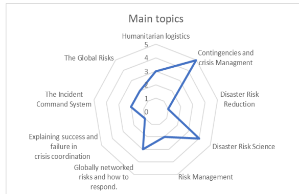
Fig. 2. Diagram of relationship main issues with number of articles reviewed

In the research in the journals, the focal themes of the research were: Contingencies and Crisis Management, Disaster Risk Science, Disaster Risk Redution, Humanitarian Logistic, Risk Management. As evidenced on the Figure 2.