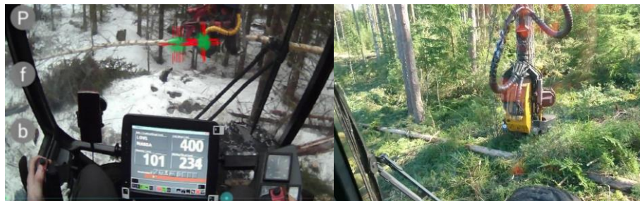
Fig. 2. The left figure shows the view taken using eye-tracking glasses, where the green dots represent the operator's gaze [33]. The right figure shows the view from a camera attached on the operator's head [26].

Although we cannot have detailed analysis on areas of attention when operating forest harvesters like what Häggström et al. [12] and Wallmyr [33] have done using eye-tracking glasses (see Fig. 2), we are still able to determine where the operators were looking at when performing their tasks. There are five videos where the recording cameras were attached on the operator's heads, thus we could estimate the direction of operators' attention (see Fig. 2).