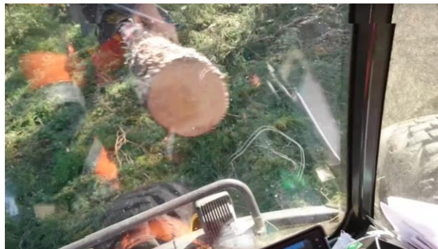
Fig. 3. The operator moved the tree in a way where the tree's diameter can be seen clearly from the front windscreen [26].

From our perspective, 21 out of 26 operators in the collected videos seem to be quite skilled since they were able to perform each operation in one attempt and with a fluent and efficient working process. This makes it more difficult to determine the most difficult parts in operating forest harvesters. However, we can still find few occasions where even skilled operators seem to have some difficulties. There were two videos that showed situations where the operators had to measure the felled tree multiple times, before cutting it. They even had to move the felled tree in a way where the tree's diameter can be seen directly from the front windscreen (see Fig. 3). This problem probably appeared due to the harvester's measuring system was not showing the right measurement based on the operators' intuition. Therefore, they had to verify the tree's diameter using their own eyes. Additionally, there was one video that showed a situation where an operator had a difficulty in removing a tree's branches. However, this kind of difficulties is more related to the forest harvester's capability rather than the operator's skills.