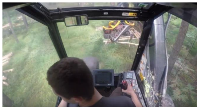
Fig. 5. The operator was turning his body when reversing the forest harvester [31].

One issue in driving these big machines in the forest is the excessive rotation when looking behind the machine. Most modern forest harvesters are equipped with a rear camera and the video stream from the rear camera is displayed on the monitor inside the cabin. This feature enables operators to observe the environment behind the machine easily without having to turn their bodies. However, there were three forest harvesters, where such feature is missing. Consequently, the operators had to turn their bodies every time they were reversing the forest harvester (see Fig. 5).