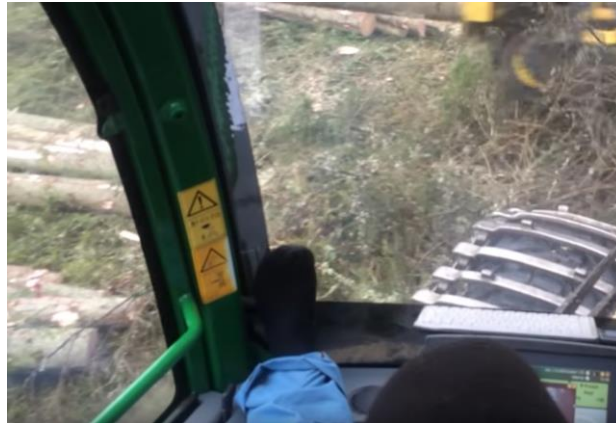
Fig. 6. The operator put his foot on the dashboard while operating the forest harvester [13]

The presence of the researcher in a field study may influence the research subject, thus making the collected data less representable of normal work conditions [19]. This phenomenon has also been observed in the context of forest harvesters, where operators tend to perform better during the study than normal working situations [23]. From 26 videos that we have collected, only four videos were recorded by someone else inside the cabin. The remaining 22 videos were recorded by the operators themselves. Although there is still a possibility that the operators might be pretending when the videos were recorded [1], the self-recorded videos do not provide intrusiveness like what traditional field studies do. Although this is not a guarantee for unbiased behaviors, however, as an example, there was an operator who put his left foot on the dashboard while operating the forest harvester (see Fig. 6). This unique behavior is unlikely to occur when there was someone else inside the cabin.