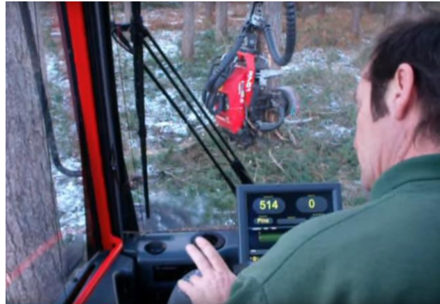
Fig. 4. The operator was looking at the buttons on the armrest before pressing them [8].

them in order to avoid pressing wrong buttons (see Fig. 4). This implies that it is not easy to remember all functionalities of the instrumentation in forest harvesters.