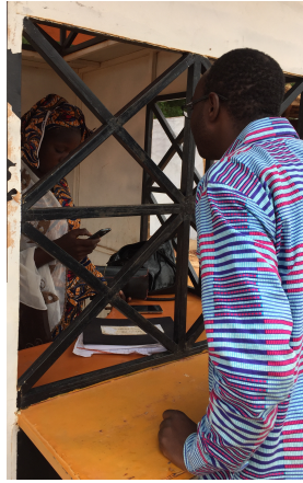
Fig. 1. A customer completing a transaction at a dedicated kiosk in Ségou.

It is important to mention that the mobile application is only available for Android devices. It is also important to mention that the mobile application of the service under investigation is not a user-friendly one. An expert evaluation revealed that the app suffers from major usability problems, particularly in terms of consistency.