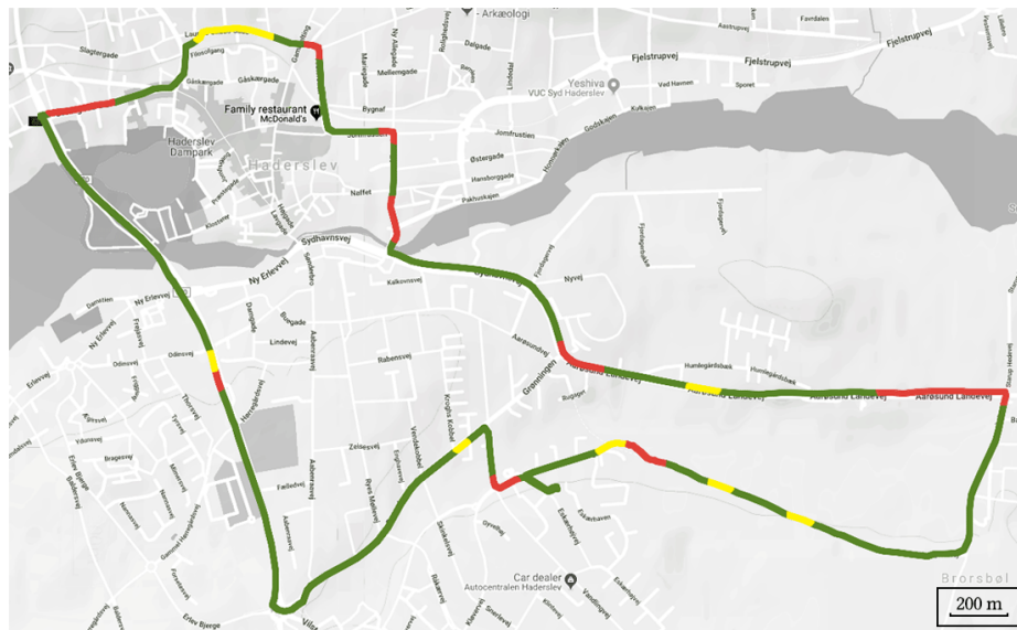
Fig. 2. First route driven by test participant T1, with color coded LowCO 2 (Green), MediumCO 2 (Yellow), and HighCO 2 (Red) peaks.

The cycling trips for the seven participants covered a total of ~47 km. When asked on what basis the test participants chose the cycling route, five of the seven test participants replied that the route choice was based on the expectation of seeing a red LED - meaning they chose roads which they hypothesized had high traffic density and therefore would lead to a reduction in air quality. Test participants T4 and T5 simply used the system for work-related commuting.