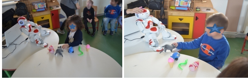
Fig. 1. Implementations of Farm Animals (top), Ling Sounds Story (bottom)

In terms of data collection, the school therapist recorded each child’s performance in every activity completed (Ling sounds story, Music density, Farm Animals, Vegetables) in every session. Although NAO gave a “try again” option for the sake of play and learn, for data collection purposes the therapist marked a correct answer only on child’s first trial and only for correctly detected sounds. Table 2 presents an example of data recording for the “Ling Sounds Story.” Similar tables were used for data recording of other activities in every session and for each participating child. At the end of the activity the therapist together with the special teacher who observed the study participated in a group-interview with the researchers (authors of this work). The interview aimed to elicit details about the overall experience and perceived added value of the technology.