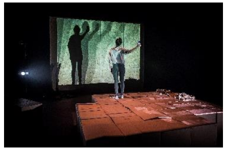
Fig. 2. Digital projection of young company recordings in "A Song for Ella Grey"

The technology was felt as an integral and necessary aspect of the play, working towards extending their role. Their role in the performance took the form of a digital Greek "chorus" where the protagonist would be able to talk to and discuss her thoughts with, and thus becoming an integral part of the performance. What was strongly expressed through their post-show questionnaire responses was the ability to feel on-stage without physically being there and the inclusiveness that the technology allowed in such a new format. As individuals voiced: