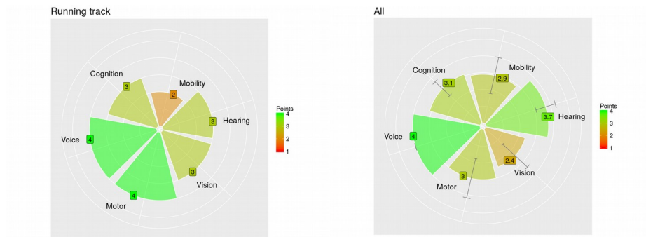
Fig. 2: Example assessment of the exhibit “Running track” (left), and mean and standard deviation of the accessibility indicators for all evaluated exhibits (right)

ations where pupils argued about the “ownership” of numbers, and sometimes they were unable to say who had won, because they were not capable of comparing two given numbers. Also, the correct understanding of the unit “km/h” cannot be expected by pupils in the lower ages (C).