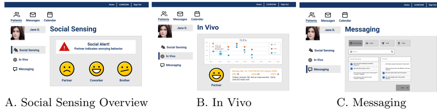
Fig. 1: Clinician Facing Feedback from Trusted Others

The social sensing prototype has three main sections: (1) a social sensing overview section that would enable a clinician to view a trusted others assessment of a patients progress (Fig. 1A), (2) an in vivo section that displays a trusted others assessment of a patients in vivo session (Fig. 1B), and (3) a messaging section that would enable a clinician to message a trusted other with pre-formulated questions pertaining to a patients state and progress (Fig. 1C).