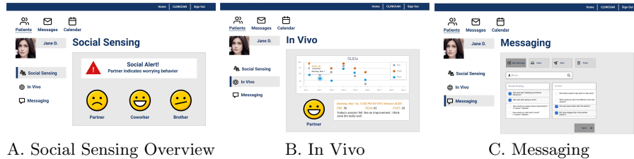
Fig. 1: Clinician Facing Feedback from Trusted Others

The social sensing prototype has three main sections: (1) a social sensing overview section that would enable a clinician to view a trusted others assessment of a patients progress (Fig. 1A), (2) an in vivo section that displays a trusted others assessment of a patients in vivo session (Fig. 1B), and (3) a messaging section that would enable a clinician to message a trusted other with pre-formulated questions pertaining to a patients state and progress (Fig. 1C).