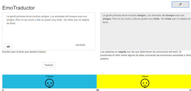
Fig. 2. Final version of the EmoTraductor interface.

the satisfaction of both end users and experts with the process and the results obtained with the application. The evaluation of EmoTraductor was performed with a total of 9 users with AS and 2 experts from the association.