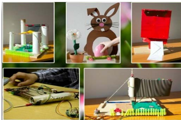
Fig. 3. Student results of Physical Computing: Interactive objects with embedded systems.

The discussion about digital media has been and still is mainly related to software that is used on universal hardware (e.g. PCs, tablets, smartphones); the hardware itself is generally assumed to be given. With the increasing miniaturization and spread of microcontrollers, which are used as embedded systems in the most diverse objects of everyday life, the typical image of “computers” is also changing. These can also be found today in cars (modern cars have over 100 networked microcontrollers) and watches as well as in interactive toys. Microcontrollers are also becoming increasingly important in educational contexts. The Calliope project (cf. [9]) plans to make a programmable microcontroller available to primary school children throughout Germany from spring 2017 in the form of the Calliope mini, with the aim of turning children from passive users into active designers of digital media. Other hardware platforms such as Arduino and Raspberry Pi have also become widespread and enable the creative design of interactive objects, known as physical computing, with hardware and software. Such interactive objects consist of various sensors that collect data (e.g. volume, temperature, brightness) and actuators (e.g. LEDs, motors, speakers) that can respond based on the data collected by the sensors.