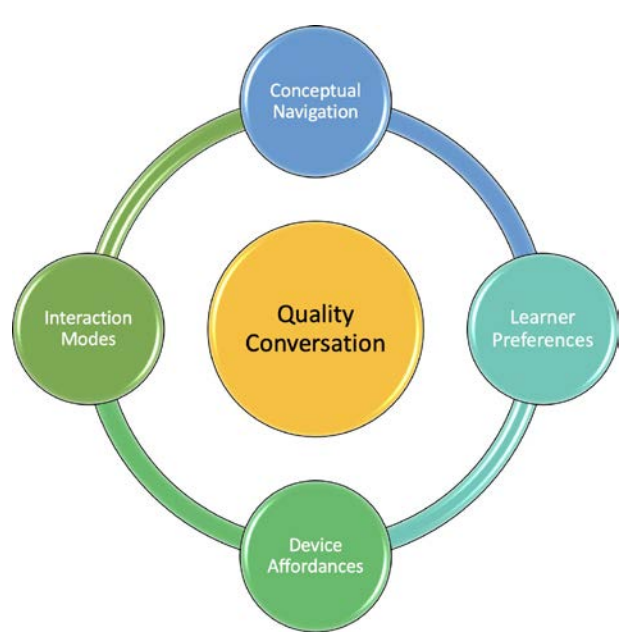
Fig. 1. 5 design principles

Apart from the first principle, a quality conversation, the other four represent adaptation to different aspects. The learner preferences principle adapts to the learner, the device affordances principle adapts to the device, the conceptual navigation principle adapts to the topic under study, and the interaction mode principle adapts to the mood and need at each moment.