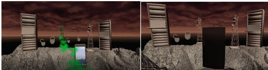
Fig. 3. VR for connecting two different IoT devices.