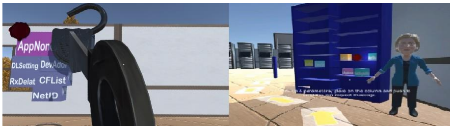
Fig. 4. Transmitted package from Network server and Packet Construction