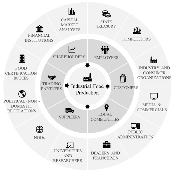
Figure 1: Mapping of stakeholders in the industrial food production ecosystem, based on [5]

to meet the increasing requirements of consumers and political regulations, demanding high quality and safety, sustainability, tracking and tracing of products, versatility and availability everywhere and at any time. Figure 1 shows the key stakeholders of industrial food production: