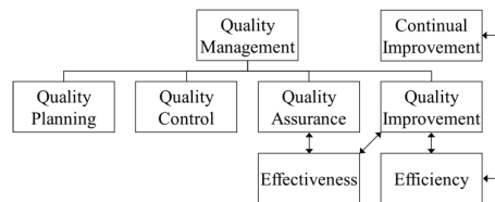
Fig. 1. A Quality Management Framework by ISO 9000:2015 [6]

In this paper, we propose a Quality Management Framework for Digital Lean Manufacturing based on the four ISO 9000:2015 pillars [6] of Quality Management: (i) Quality Planning, (ii) Quality Control, (iii) Quality Assurance, and (iv) Quality Improvement (see Fig. 1). Critical to this is the Lean principle of ‘ respect for people ’, which recognizes the unique contribution of human creativity, ingenuity and innovation (represented by the work of Quality Managers and their Quality Circles ) to quality planning, quality control, and quality assurance tasks, and in particular to quality improvement duties, given the onset of digital technologies in combination with the new practices of quality management.