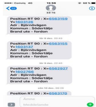
Figure 1. SMS-dispatched ICT solution for volunteers. The example displays outdoor fires in vehicles.